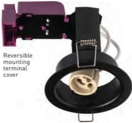
Reversible mounting terminal cover